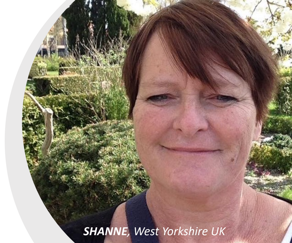
SHANNE , West Yorkshire UK

The course teaches how to transfer face-to-face skills to work online or via telephone.